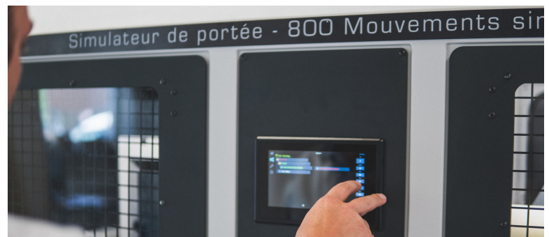
Servo Spin Software : user-friendly and flexible cycle creation

On-board intelligence guarantees independent operation and eliminates any disruption caused by PC updates or shutdowns.