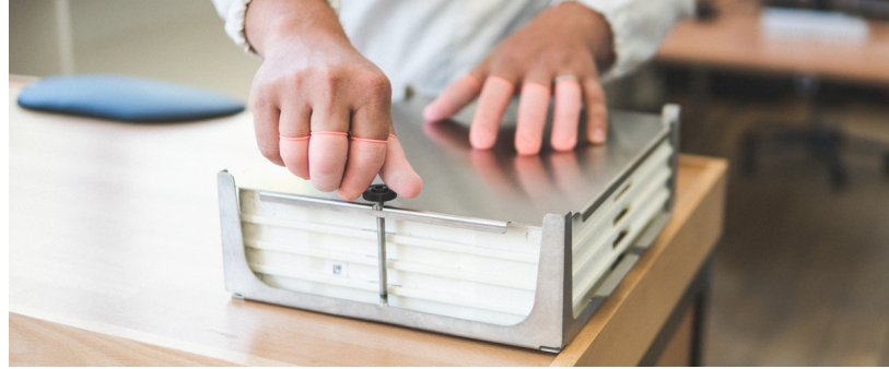
Simple loading structure adaptable to all types of packaging

2 independent, programmable stations with Servo Spin software: